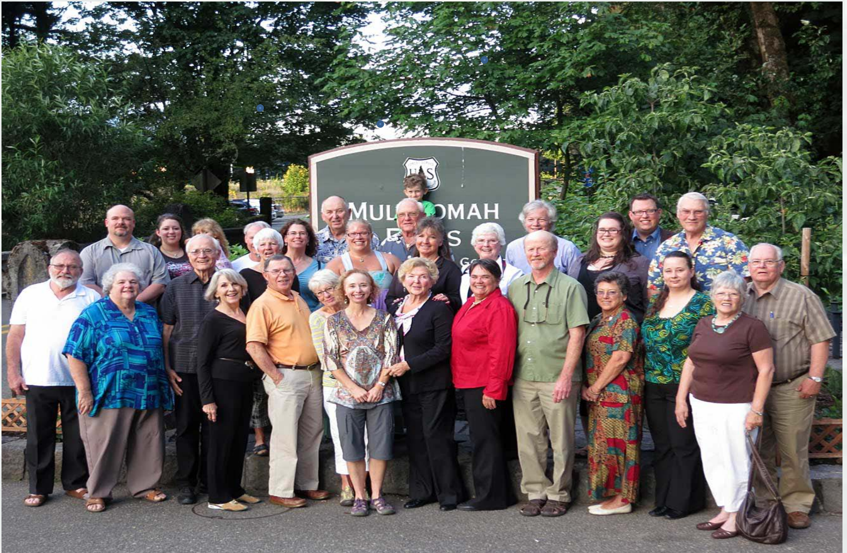
2012 Volunteer Appreciation Annual Dinner