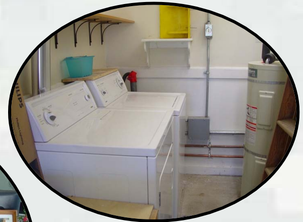
Onsite Laundry Facilities