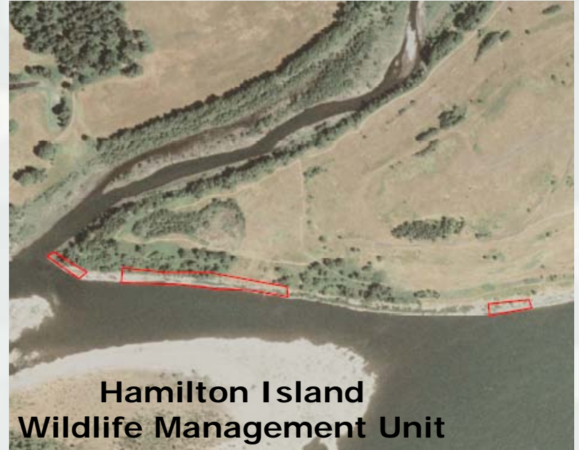
Hamilton Island Wildlife Management Unit