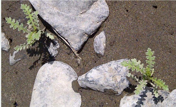
Rorripa columbiae Columbia Yellowcress